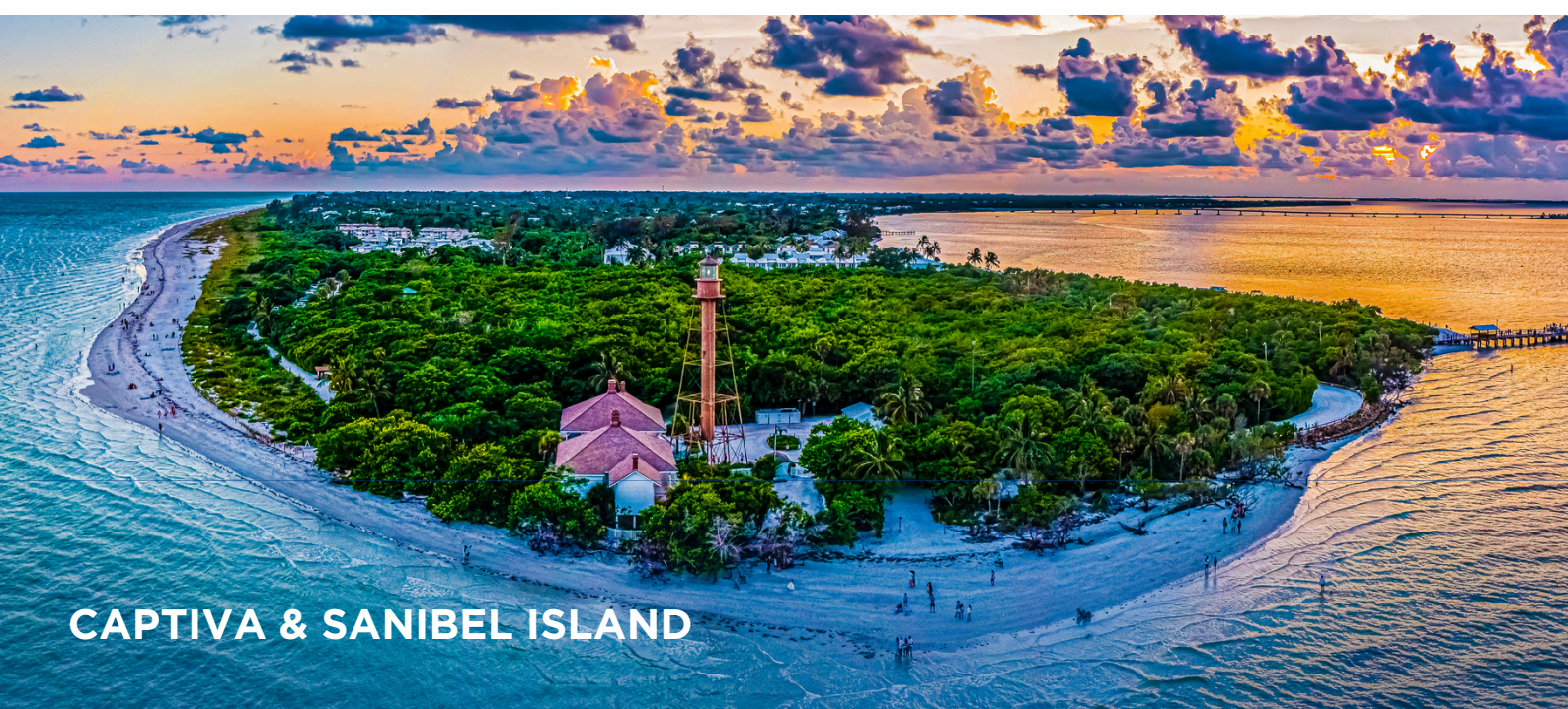
CAPTIVA & SANIBEL ISLAND